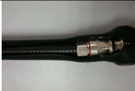
After Test close-up