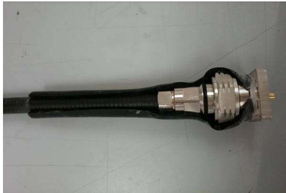
After Test close-up